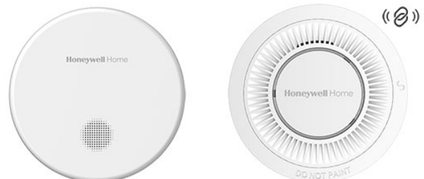
R200S Smoke Alarm