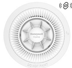
R200H-N Heat Alarm R200ST-N Smoke and Heat Alarm